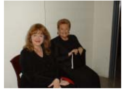
Here to Stay April 2004 Living Arts Centre