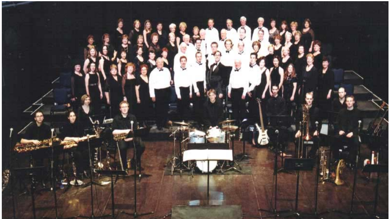
Clarkson Music Theatre cast picture for the Living Arts Centre “Unforgettable” concert in May 2003